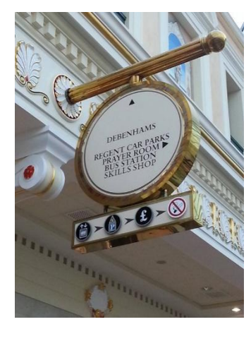
Prayer Room at Trafford Centre